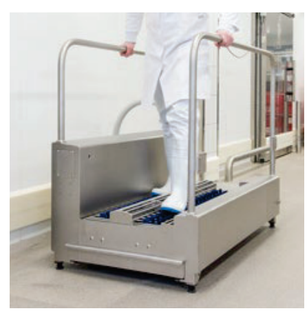
Activation of the brushes by means of light barriers