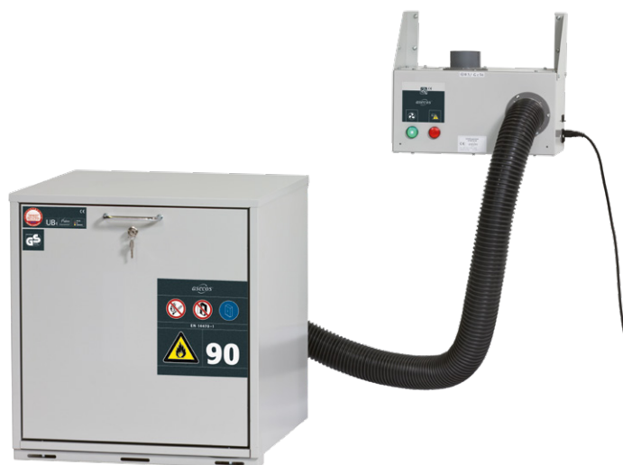
Extraction module for wall mounting for under bench cabinets, with exhaust air monitoring Order No. 24315 (under bench cabinet optional)