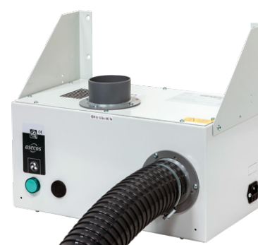
Extraction module for wall mounting for tall cabinets, without exhaust air monitoring Order No. 17178