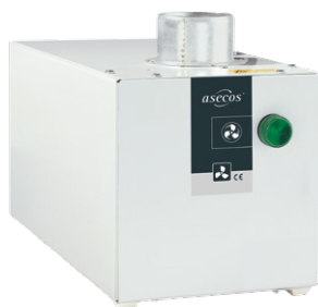
Extraction unit for tall cabinets, without exhaust air monitoring Order No. 14218