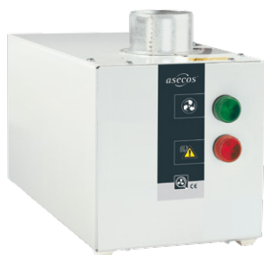
Extraction unit for tall cabinets, with exhaust air monitoring Order No. 14220