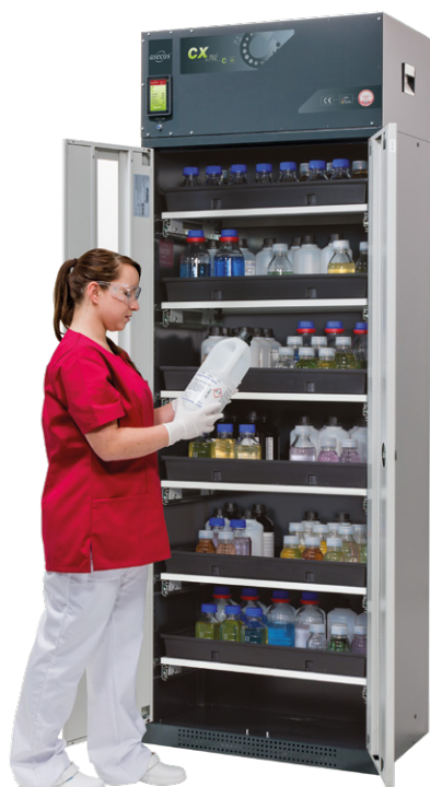
Recirculating air filter storage cabinet CX-CLASSIC-G model CX.229.081.WDFW body colour anthracite grey (RAL 7016), with glass-paneled wing doors in light grey (RAL 7035), interior equipment with 6 x pull-out shelf (sheet steel powder-coated/PP) Order No. 32929-041-30550