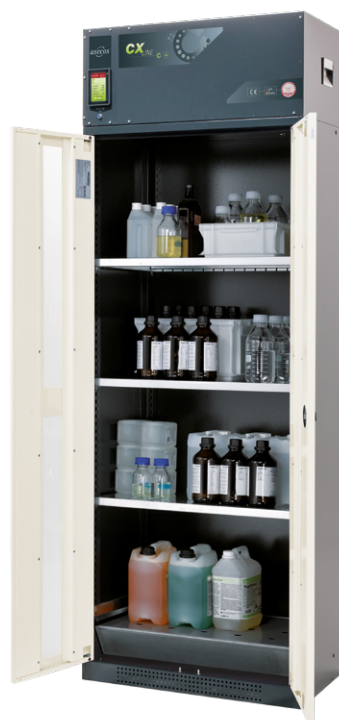
Recirculating air filter storage cabinet CX-CLASSIC-G model CX.229.081.WDFW body colour anthracite grey (RAL 7016), with glass-paneled wing doors in pure white (RAL 9010), interior equipment with 3 x shelf, 1 x perforated insert, 1 x bottom collecting sump (sheet steel galvanised) Order No. 32929-050-30542

2 door colours are available at no extra cost: