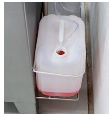
Bracket for cleaning detergent