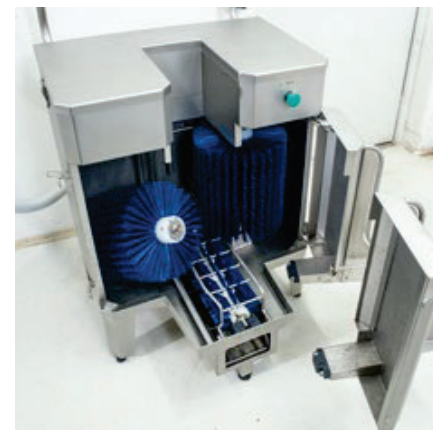
Simple opening for cleaning purposes