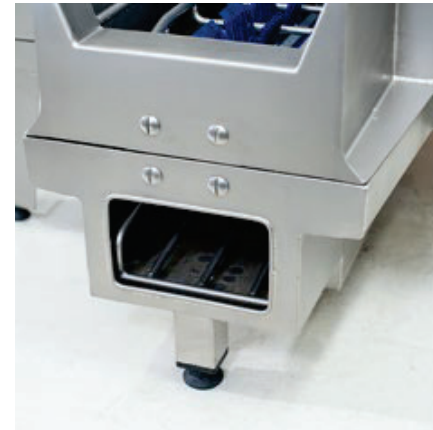
Easy cleaning of the upper shoe